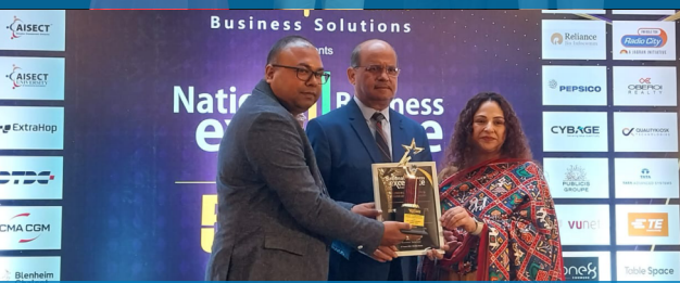
Awarded with the National Business Excellence Award 2023