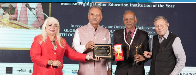
Awarded with Most emerging University of India Award 2023